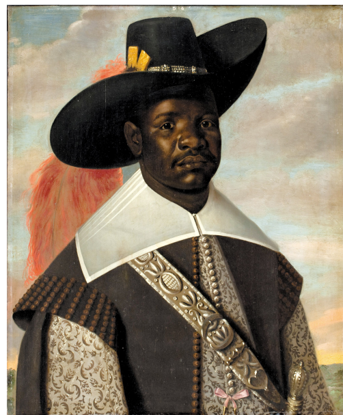
Statens Museum for Kunst, Copenhagen